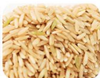
Long grain brown rice