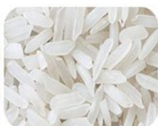
Single boiled rice