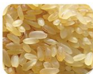
Double boiled rice